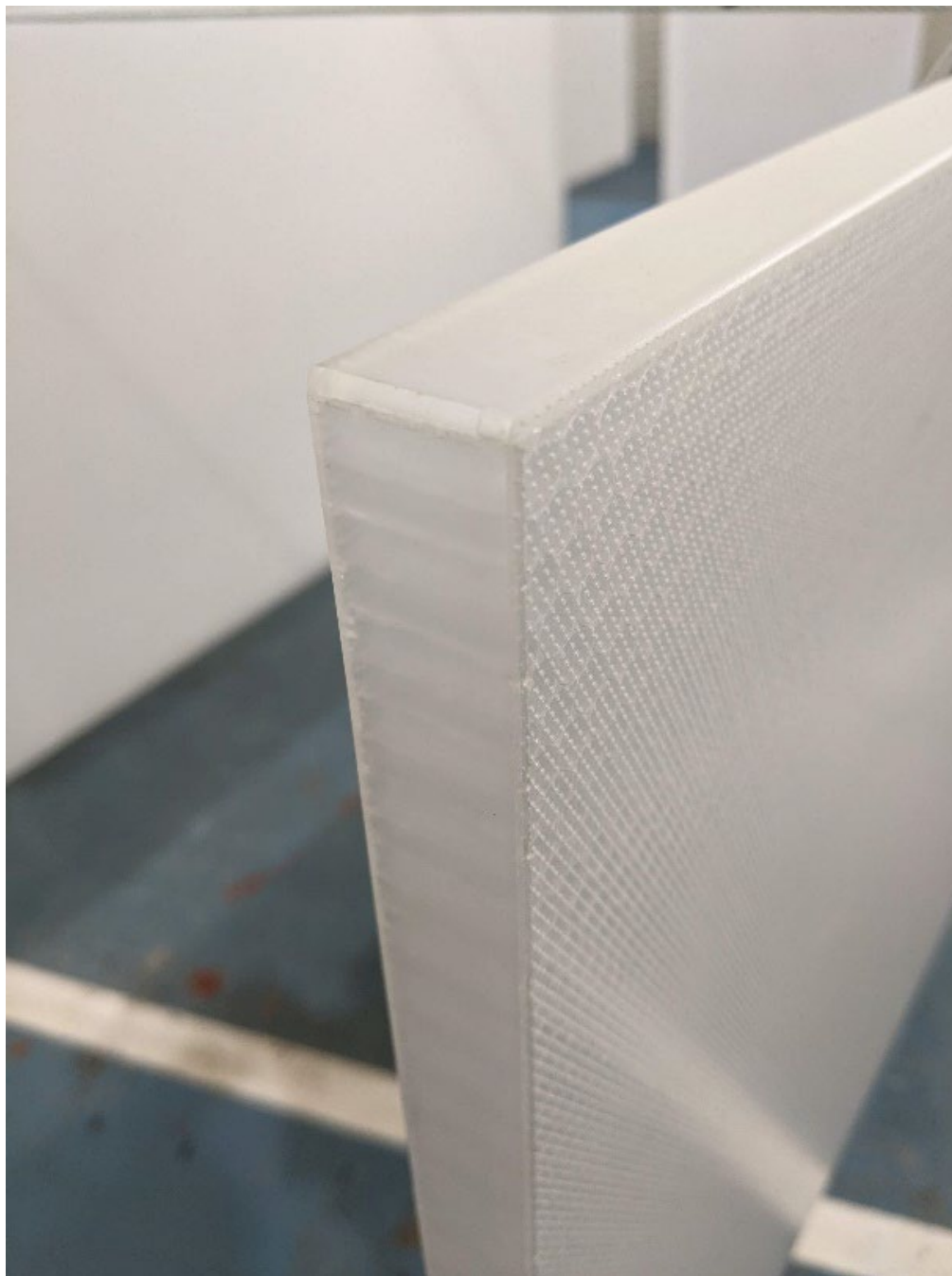
Figure 3 – Detail of specimen materials